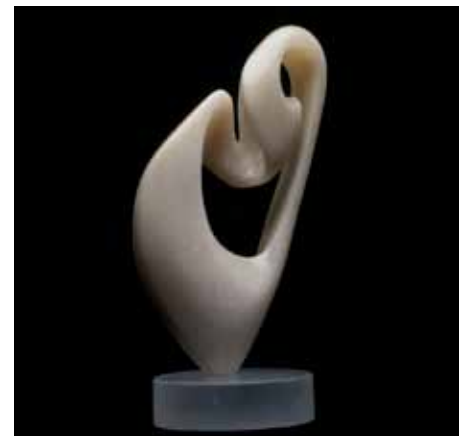
“Sculpture” by Linda Soudack SCA

They are the only public studio offering pneumatic, electric and hand tools with 24/7 access to their studio space. The ECHO studio offers a safe and healthy environment with a professional instructor &/or independent sculpting in wood and stone. www.echosculpture.com