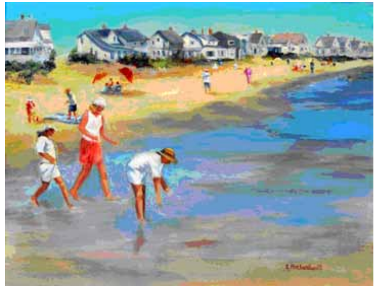
Elaine Archambault, "Jour de plage"

Her paintings cover many subjects from, Québec and France landscapes, beach scenes, florals, as well as fish in ponds. She started painting in watercolours from 1985 to 2003, since then she paints in oils and acrylics. She continues to sketch and paint in anticipation of the next major exhibition which will be in 2014. Her works are in many private collections here and in the USA.