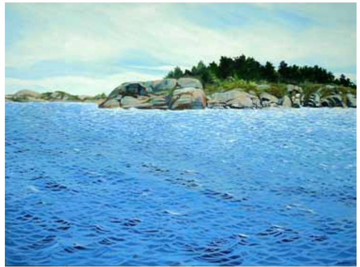
Mary Elizabeth Duggan, SCA - " Beyond the Lighthouse "

Uli Ostermann, SCA will be participating in a juried group show called Horizonte 2013 , Aug 22 - Nov 17, 2013, "BIG gallery", Rheinische Strasse 1, 44137 Dortmund, Germany.