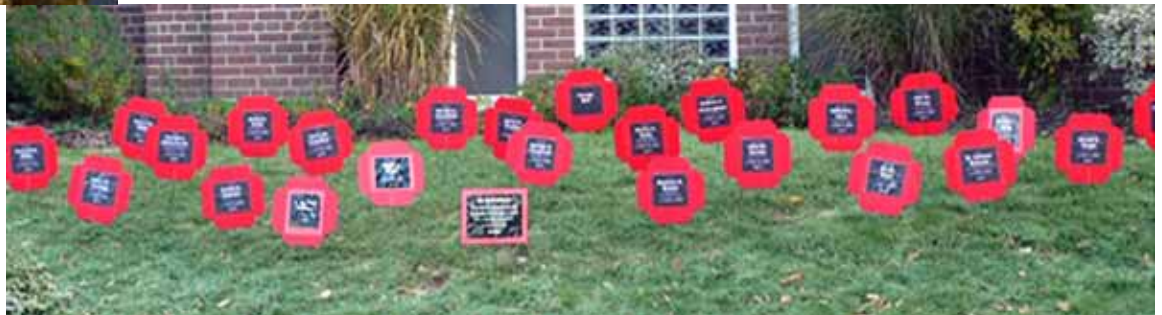
Installation in front of a local church in North Toronto