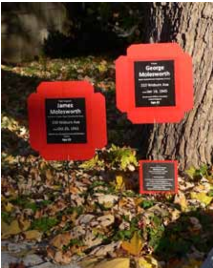
Stylized-poppy markers for brothers at address where they lived before enlisting